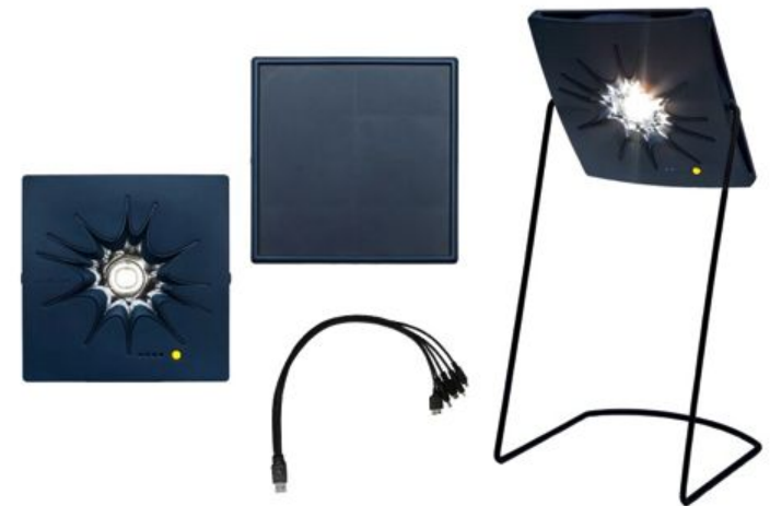
Little Sun Solar Charge